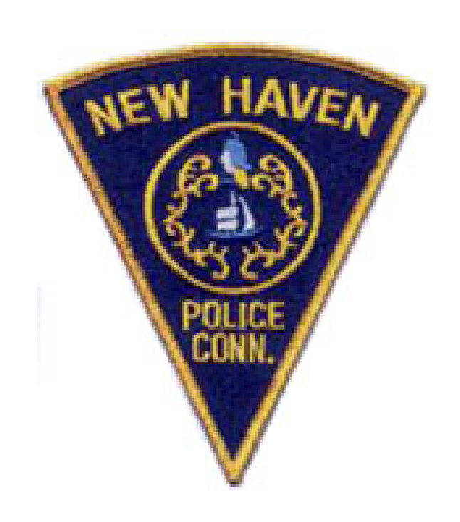
2021(3) Recruitment Process